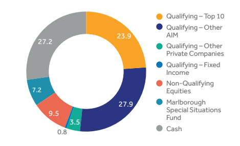
Qualifying sector allocation (%)