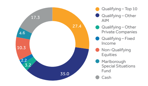
Qualifying sector allocation (%)