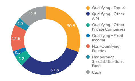
Qualifying sector allocation (%)