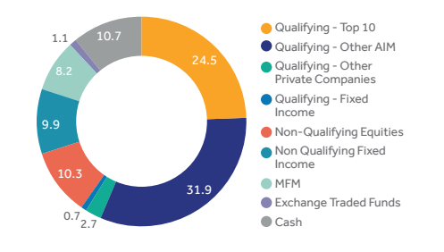
Qualifying sector allocation (%)