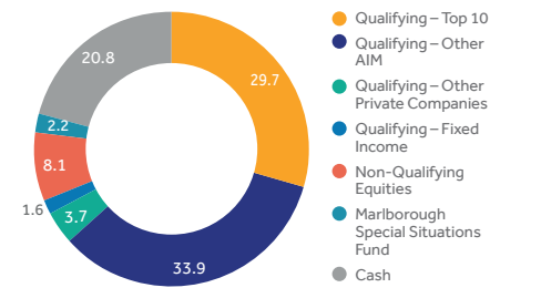
Qualifying sector allocation (%)