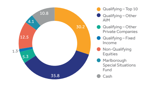
Qualifying sector allocation (%)